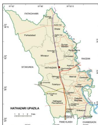
Figure 1: Map of Hathazari (Study area)

The study was conducted in Hathazari Upazilla of Chattogram District. The study period was from 17 th february, 2022 to 28 th april, 2022. Hathazari is under the Chattogram division. It is situated at 22.5083°N 91.8083°E. It comprises 52,594 households and a total land area of 251.28 square kilometers. Hathazari Upazila is comprised with 15 union parishad and further they are divided into 59 villages and 48 mouzas. The main river is Halda. It is surrounded by Panchlaish and Chandgaon Thana on the south, Fatikchhari Upazila on the north, Sitakunda Upazila on the west, Raozan Upazila on the east. Hathazari has a total population of 431,748 which includes 215,201 Males and 226,547 Females. Around 60% residents are somehow connected to agriculture, either directly or indirectly. According to information of Upazila Livestock Office and Veterinary Hospital, Hathazari, a total of 186 poultry farms (31 Layer farms, 105 Broiler farms, 5 Duck farms, 1 breeder farm, 32 Sonali bird farms, 12 Pigeon farms poultry farm) situated in this area. This study was conducted during the summer season when the range of the environmental temperature was 30.2°C (86.4°F) to 21.5°C (70.8°F). The average humidity of Hathazari Upazilla within the study period was 70%. The data was collected over a total of 48 working days when the working period was 9 am to 5 pm in the Veterinary Hospital.