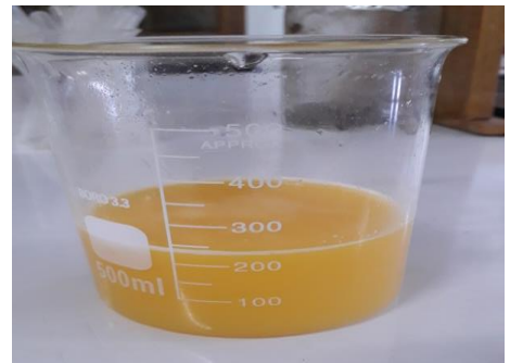
Blended mandarin juice