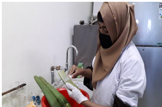
Cutting aloe vera leaves