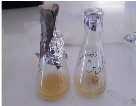
Sample for antioxidant test