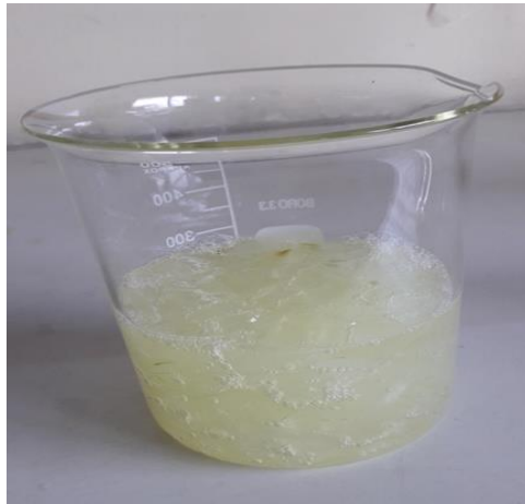
Blended aloe vera gel