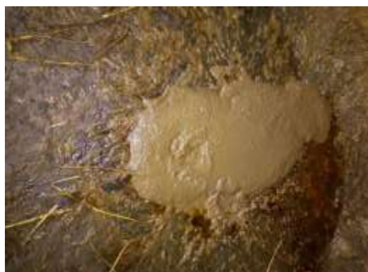
Figure 2: Fecal content of affected cow