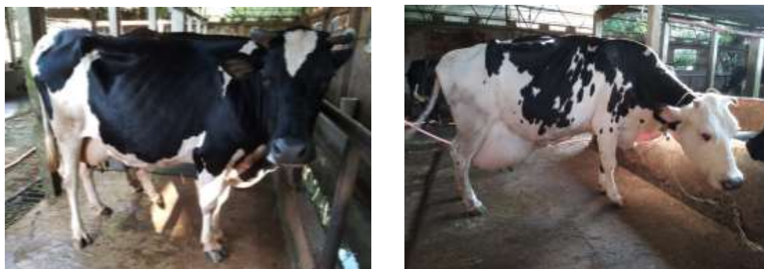
Figure 1: Affected pregnant cow (Left) and milch cow (Right)

The manager of the farm stated that the animals had been fed German grass from grassland and after 6 hours of feeding animals were showing some clinical signs (Inappetence, diarrhea, distended abdomen). The owner also administered anti-diarrheal drugs (DD Nil) and cholera saline but the animals didn't respond to treatment. After 24 hours the animals were observed, clinical history and clinical signs had been recorded. It had been found that the grassland from where the animals were fed was flooded by a nearby fertilizer industry's wastewater.