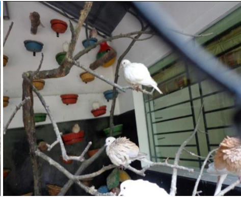
Figure :Dove bird cag

Different flock size are observed in different farms. The average flock sizes were found in the farms which is given below: