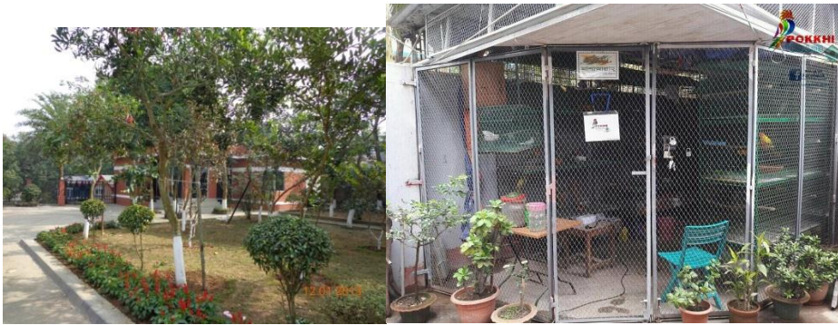
Figure 1: Overview of farm

The farms was selected for study purpose considering the easy communication, interest of the farmer for giving excess to the farm, research scope and infrastructure of the farm.