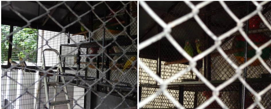
Figure 3: Nest provided in the house.