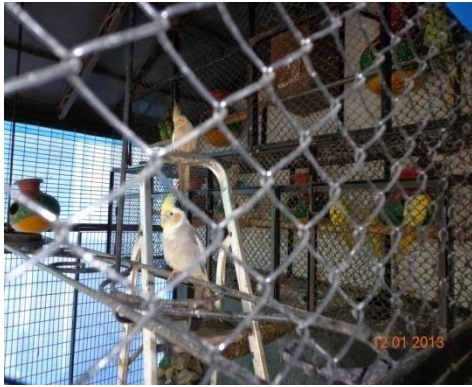
Figure: Cockatiel cage