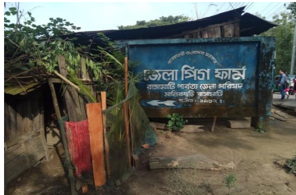
Fig: Front gate of the Zilla pig farm.

The farm is located at the Manikchori Union of Rangamati SadarUpazilla, Rangamati. The farm was established at the time of 1982.