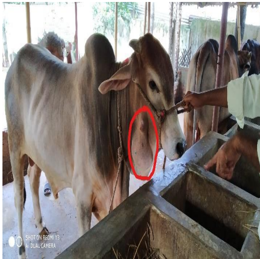
2. Abscess in Neck region

The following figures portrays the sequential steps followed in the surgery (a) Neck abscess (b) Sedation using Xylazine hydrochloride (c) Shaving the abscess area (d) Making the incision (e) Removal of the pus (f) Cleaning the content & passing the seton (g) 9th day after dressing (h) 15th day after dressing (i) 18th day after dressing (j) healing at 19th day after surgery.