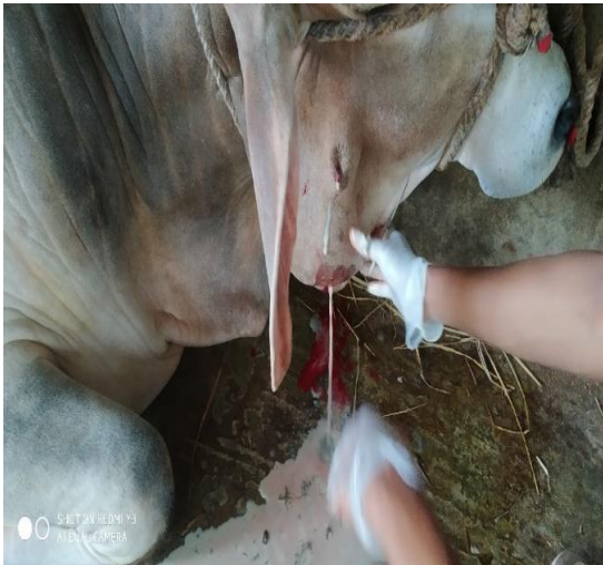
6. Removal of the pus