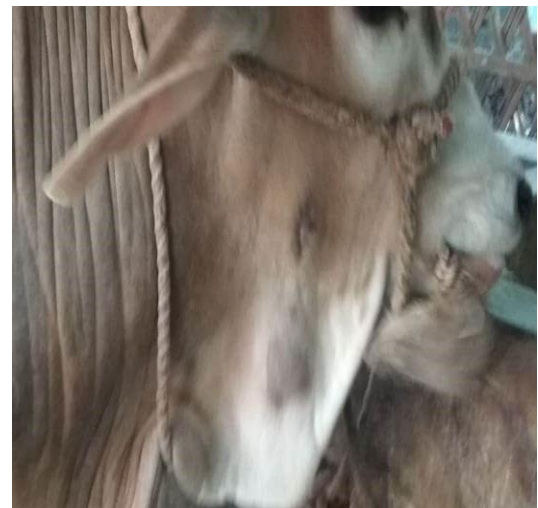
11. Healing at 19 th day after surgery