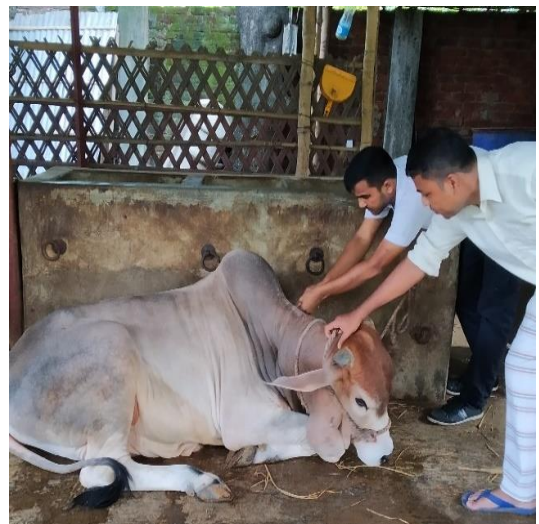
3. Sedation using Xylazine hydrochloride