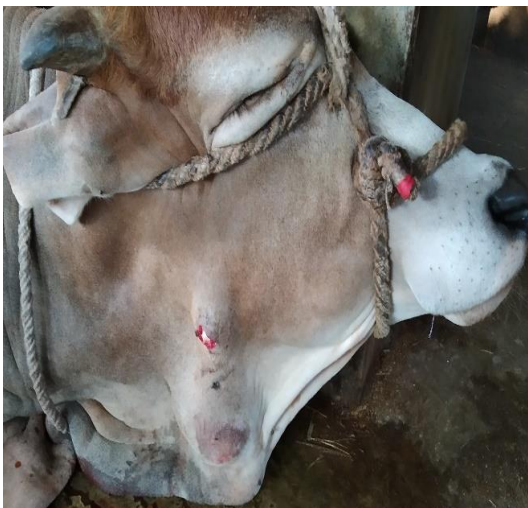
10. 18 th day after dressing