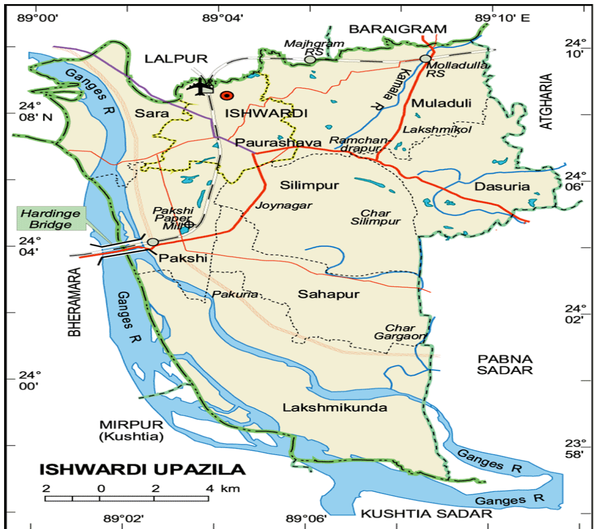
Figure 1: Study area

A 4-years-old bull of 400kg body weight in Ishurdi upazila, pabna, with a complaint of large growth in neck region was presented for the treatment. The bull was so aggressive. In few days ago, the owner unconsciously hit the bull in neck region with a blunt stick for restraining purposes. After few days of hitting, a large mass was produced in neck region which was semi- hard in consistency but painful to touch that is presented for correction purpose.