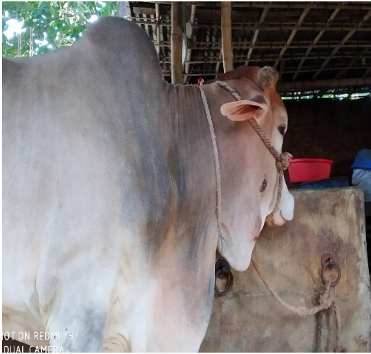
8. 9 th day after dressing