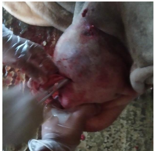
7. Cleaning the content & passing the Seton