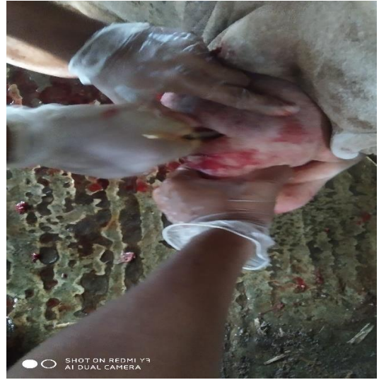
5. Making the incision