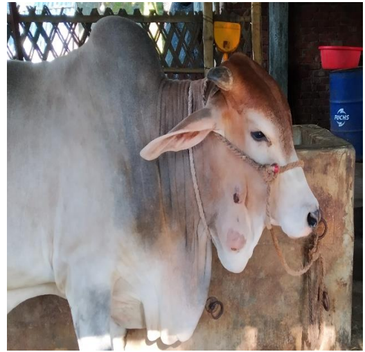
9. 15 th day after dressing