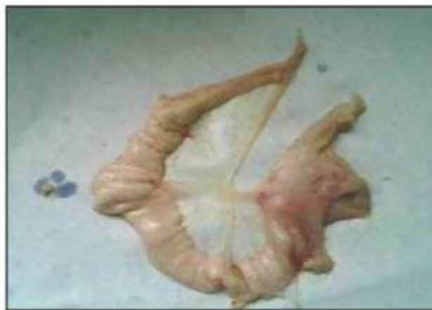
Figure (d): Left oviduct of deshi chicken dissection

information of adult deshi laying hen at 8-11 months old.