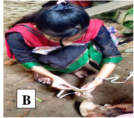
Fig 3: Measuring of (A) wing length; (B) bill length of indigenous ducks