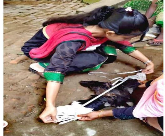
Fig 2: Measuring of wing span of two indigenous ducks