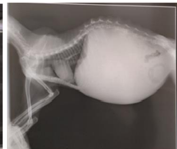
Figure 3: Radio Opaque zone & ascities