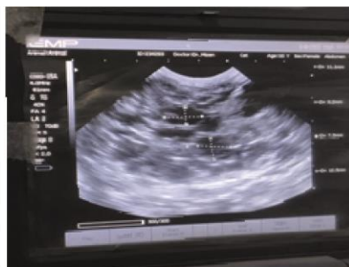
Figure 2: Cysts in liver