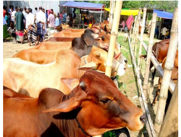
Figure 5: Cattle standing without any roof