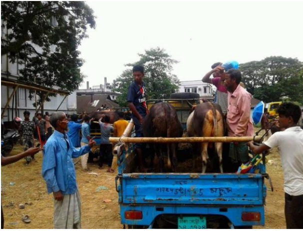
Figure 2: Cattle transport on Vehicle