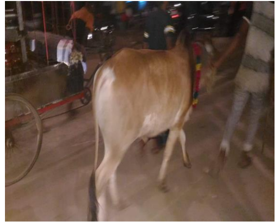
Figure 3: Cattle Transport on Foot