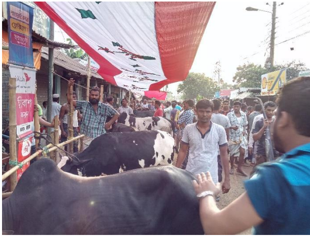
Figure 6: Provide a roof for protecting the sunlight