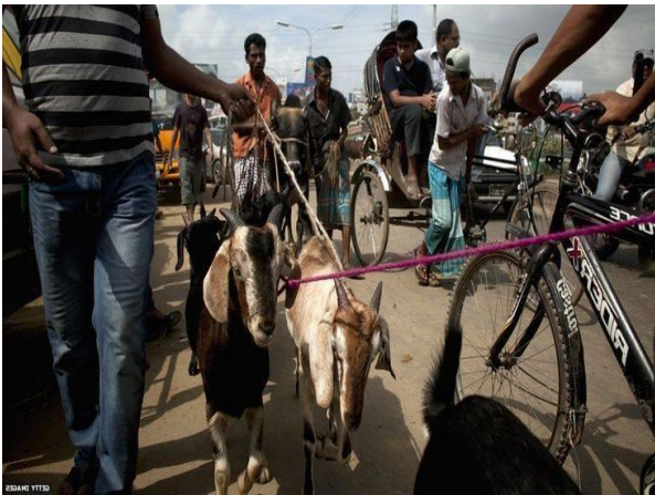
Figure 4: Goat transport on foot