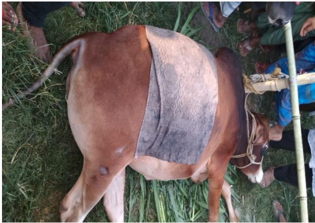
Figure 8: Heat Stress affected Cattle