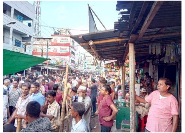
Figure 7: Over crowded people at the market