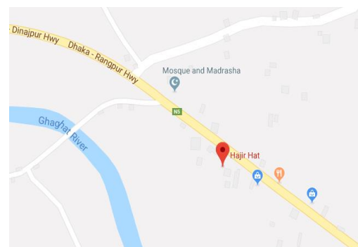
(b) Hajir Hat cattle market