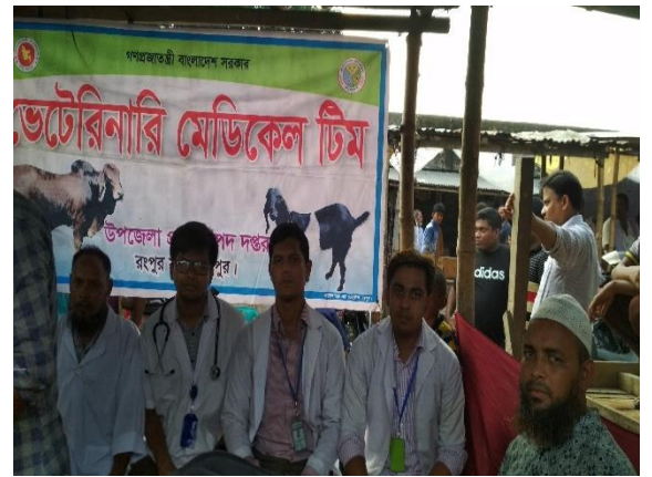
Figure 9: Monitoring the market with medical team as a doctor