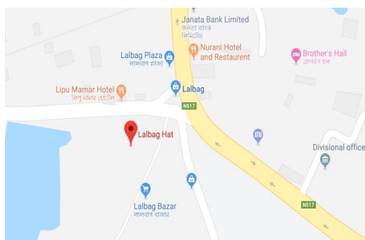
(a) Lalbag Hat cattle market

This study was undertaken firstly in the Lalbag cattle market which is managed by the DLS (District Livestock Service) of Rangpur Sadar, Rangpur. This is the second largest livestock market in Rangpur, where cattle and goat from different regions of Bangladesh and imports from India are presented by local traders for sale to sacrifice for qurbani in Rangpur. Secondly, I went to the Hajirhat cattle market and at last I went to the Burirhat cattle market. These two cattle market based on native cattle and goat rearing by rural people. In this study, these three places (Figure 1) were selected for reflection of animal welfare in the Rangpur city corporation.