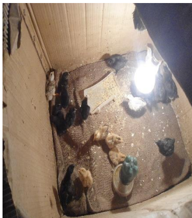
Figure-5: Brooding of chicks birds