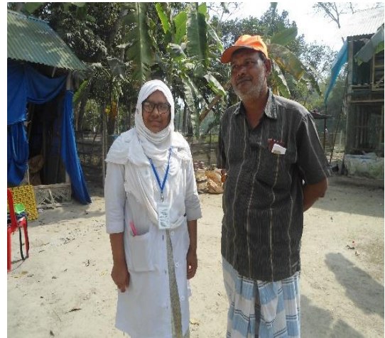
Figure-9:With organic farm