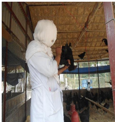
Figure-6: Physical examination of birds