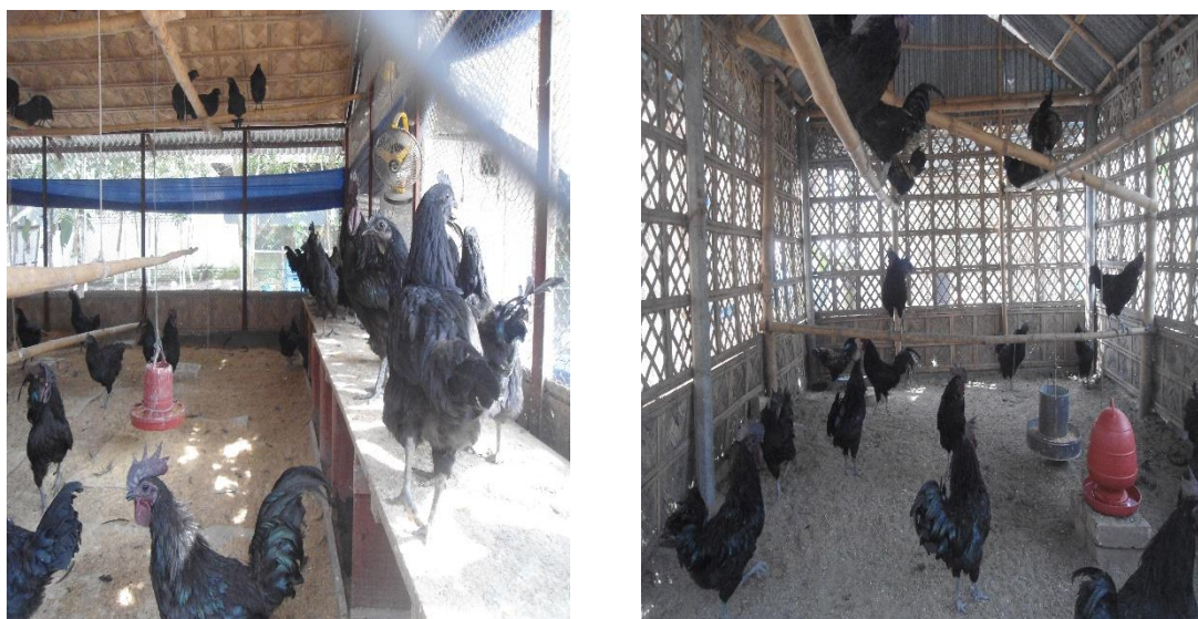
Figure-4: Housing of Kadakhnath chicken