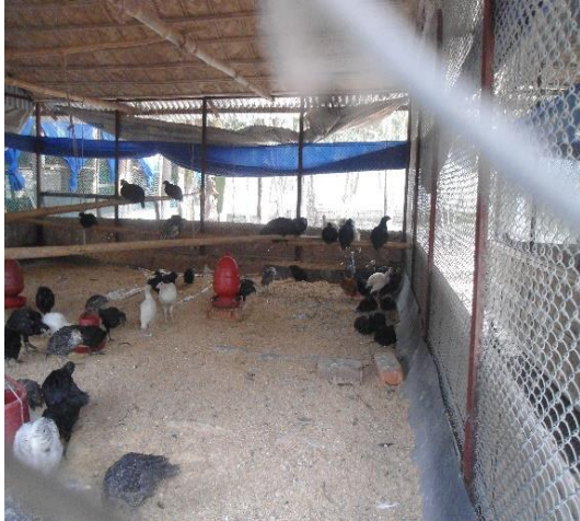
Figure-8: kadaknath mate with other breeds owner