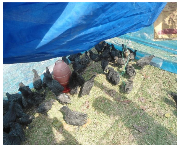
Figure-3: Feeding of birds in free range area surrounded by nets