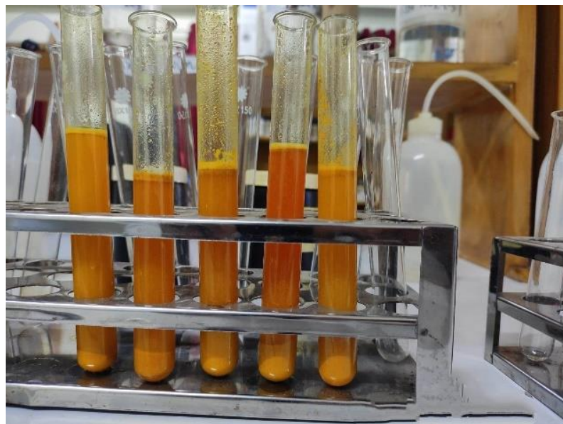
Fig: Aniline dye test in the spice of turmeric powder