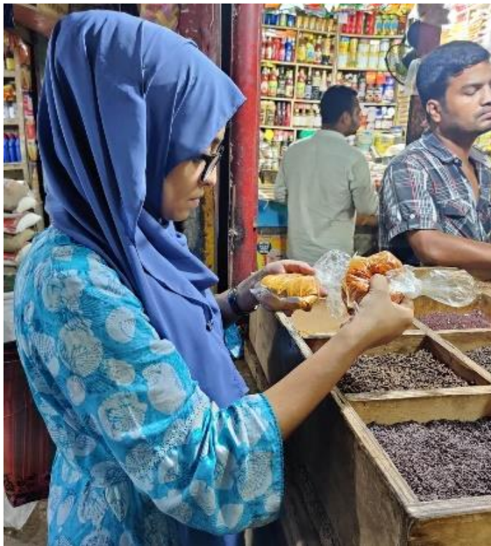
Fig: Sample collection from grocery shop