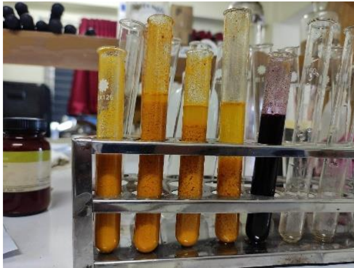
Fig: Metanil yellow test in the spice of turmeric