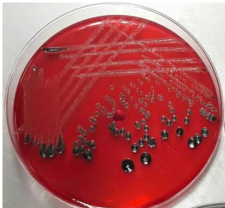
Fig: Salmonella sp. on XLD medium