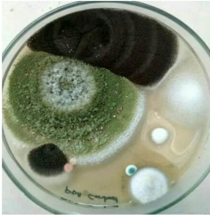
Fig: Mold on PDA medium