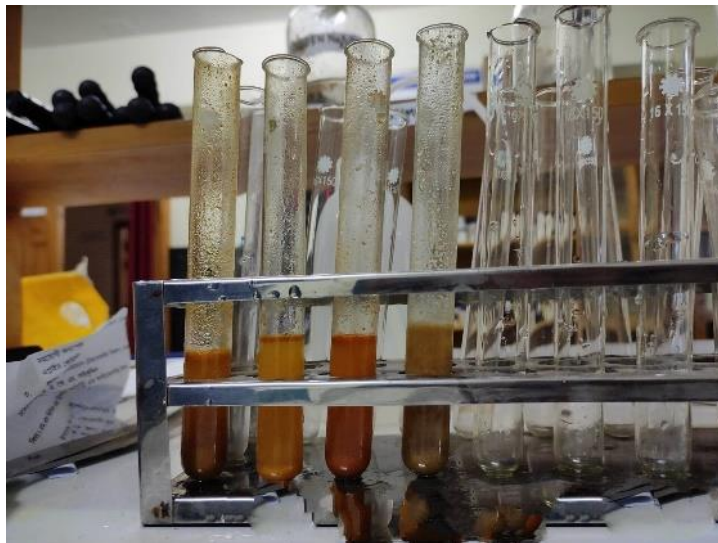
Fig: Metanil yellow test in the spice of fish curry masala