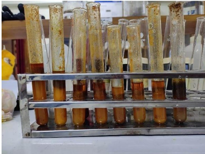
Fig: Metanil yellow test in the spice of beef masala