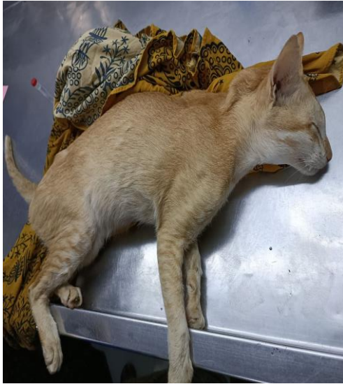
Fig 1: FPV affected cat