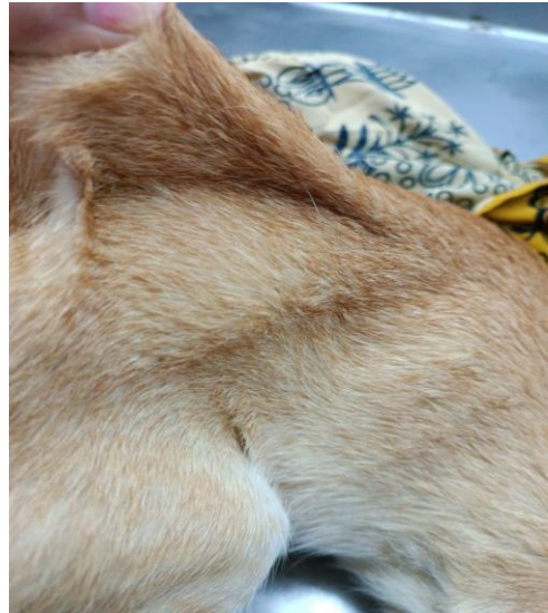
Fig 2: Dehydration