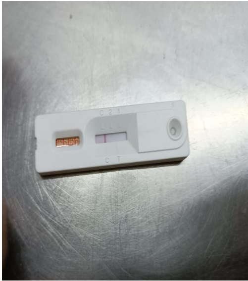
Fig 5: Before adding sample (Band is only in “C” zone)