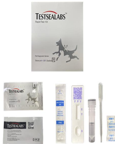
Fig 3: Rapid Ag test kit