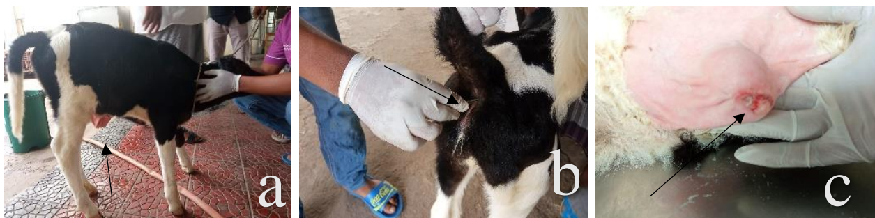
Fig: Case History and Diagnosis (a,b & c) where, a = swelled naval region, b = temperature checking and c = pus accumulation on the naval area.

A 13-day-old female calf was admitted to SAQ Teaching veterinary hospital, CVASU, Chattogram, Bangladesh. The weight of the animal was 28 kg. The owner complained that the calf suffered from swelling in the naval area for 1 day. As a clinical sign, there was seen heat and pain with swelling in the naval area. There was an abscess with pus coming out from it. The body temperature was 104°F.