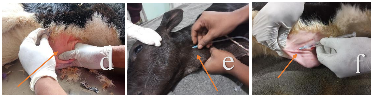
Fig: Preoperative procedure (d-f); where, d = dressing, e = fluid therapy, f = local anesthesia (ring block).

The patient was prepared aseptically and secured in a dorso-ventral position. Local anesthesia (ring block) was performed with 2% lidocaine @ 6mg/kg body weight (8.4 ml).