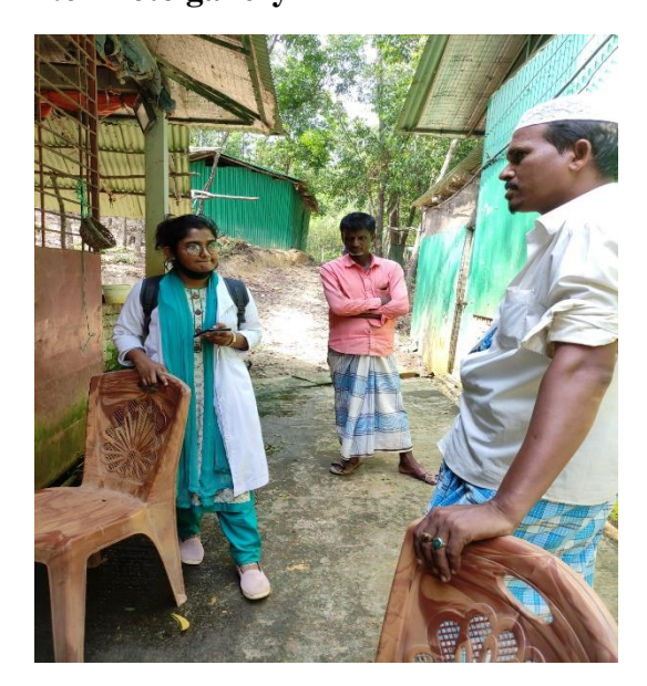
Figure 1 Information Collection