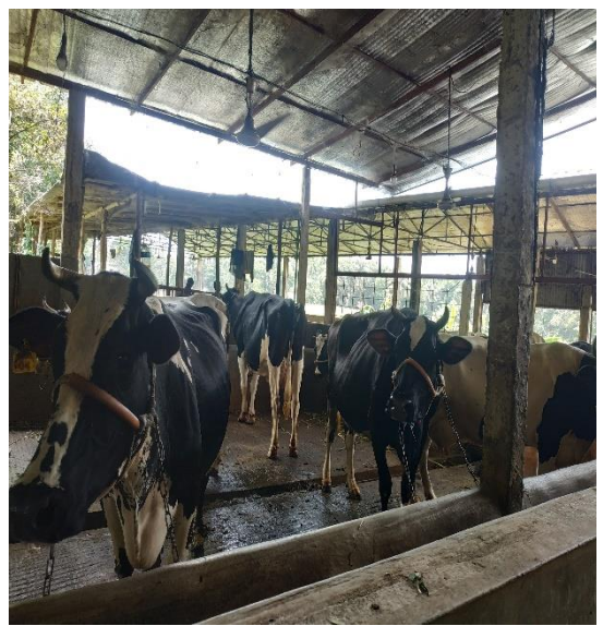
Figure 2 RCG Agro Dairy Farm