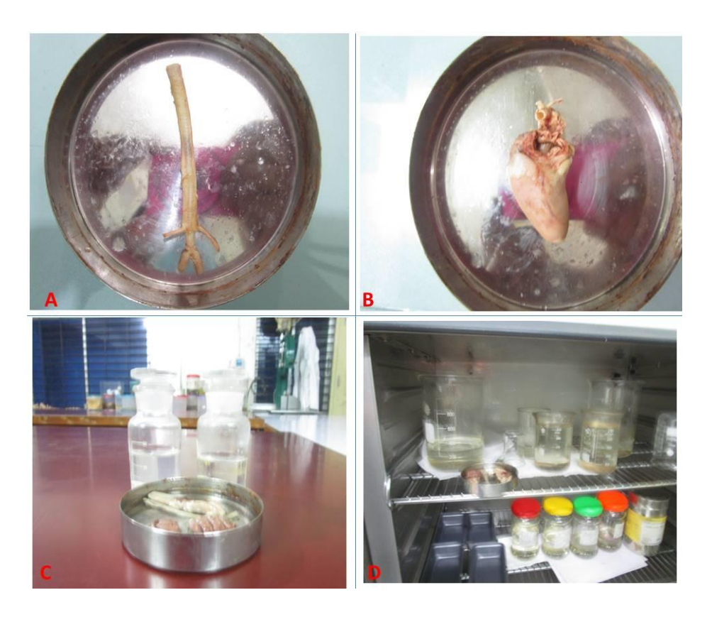
Figure 2: Fixation and Dehydration of the collected samples. (A, B) Fixation of samples (syrinx and heart) in 10% formalin. (C, D) Dehydration of samples by using 70% acetone which were repeated for three times and each for three days.