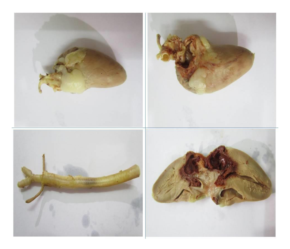
Figure 3: Modified plastinated samples (heart and syrinx) of a chicken, plastinated whole heart in 1<sup>st</sup> and 2<sup>nd</sup> images, plastinated syrinx in 3<sup>rd</sup> image and plastinated heart in longitudinally dissected section in 4<sup>th</sup> image.