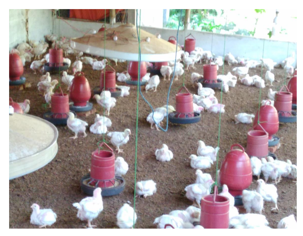
Figure: Feeding system of a broiler house.