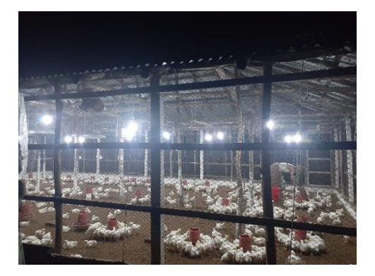
Figure 5: Lighting of the broiler house in the study area.