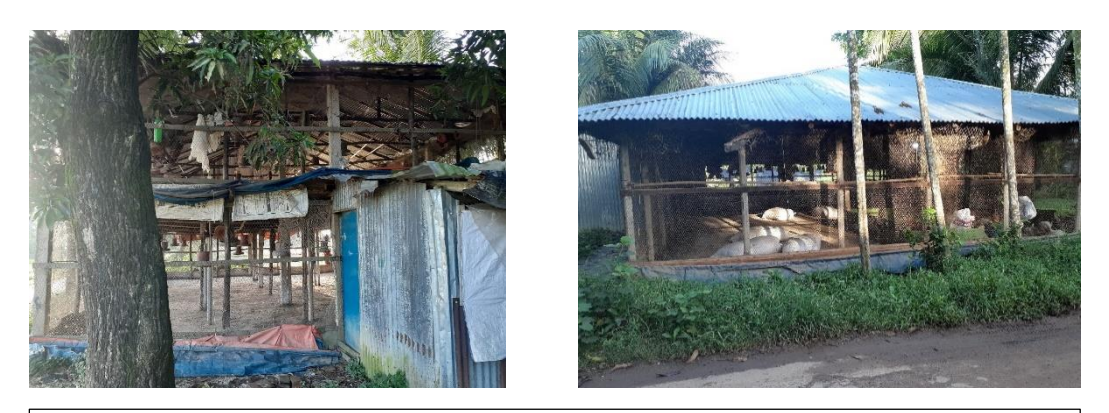
Figure 1&2: broiler farm shed in study area. (1 is two-storied house and 2 is single storied shed)