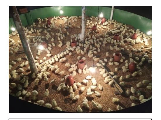
Figure 3: Brooding of DOC within the chick guard (4<sup>th</sup> day)

Figure 1&2: broiler farm shed in study area. (1 is two-storied house and 2 is single storied shed)