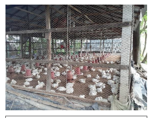
Figure 4: Feeder and drinker placement in broiler farm.