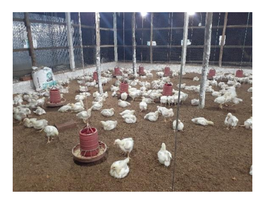
Figure 6: An inside view of birds condition at night.