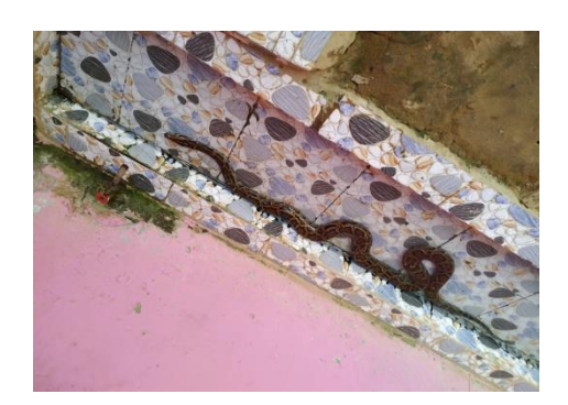
Figure 5: Swimming

Feeding: Only indigenous chicken were provided in 5-7 days interval and they usually hunted those from 10 am to 4 pm. Feeding rate was higher from September to November than from December to March. In 15-20 days of age, they started their selffeeding.