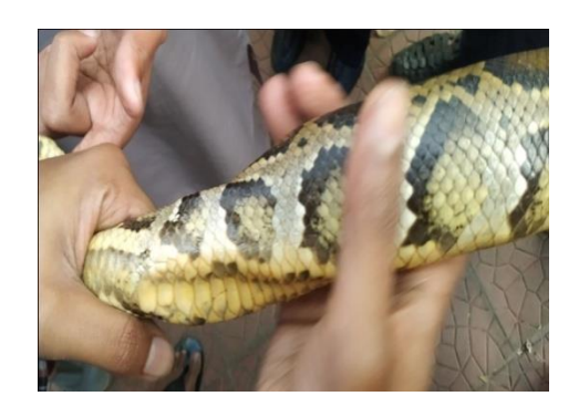
Figure 2: Body pattern

Morphology: Python molurus had greyish yellow in color and their ventral portion was whitish to yellow in color. Irregular shape blotched type body pattern was observed from neck to tail. The pattern was brownish to greenish in color with black outline and sometimes presented brown shades. They had a triangular head with arrow shape marking on the head and also had backward curve arrangement of teeth.