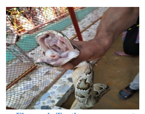
Figure 4: Teeth arrangement