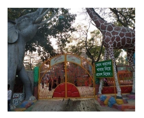
Figure 1: Chattogram Zoo

Study site: Chattogram zoo is a private zoo which is located at Foy's lake (22<sup>0</sup>22'0"N 91<sup>0</sup>47'46"E), South Khulshi in Chattogram city, Bangladesh, with an area of 6 acres of lands .There are about 320 animals of 67 species including avis, reptiles and mammals.