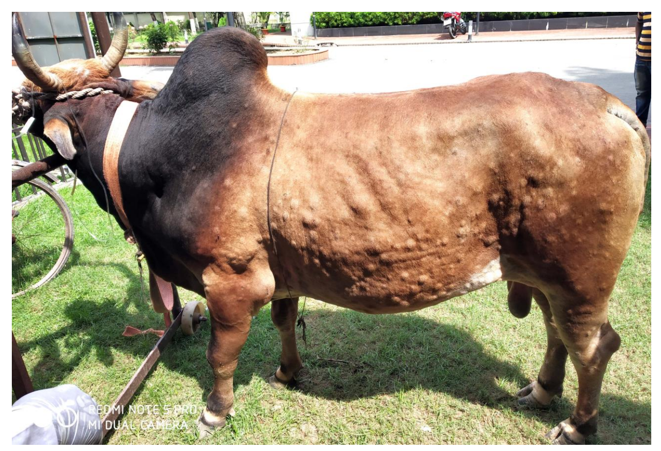
Figure : First day visit at CVASU with lumpy skin nodular lesions.

A local breed bull was examined at Chattogram Veterinary and Animal Sciences University on October 2, 2019, with nodular eruptions on different body parts. According to the complaints, the feed intake and performance of the animal was also reduced. The animals were kept in communal grazing land with other herds and they were not vaccinated for more than a year. Upon physical examinations, the bull was lethargic and feverish with the rectal body temperature of 104°F and 62 beats/min and 34 breaths/min heart rate and respiratory rates