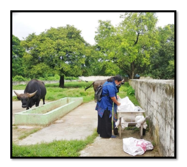
Figure 1.2: Feed sample collection from Bangladesh National Zoo, Mirpur, Dhaka.