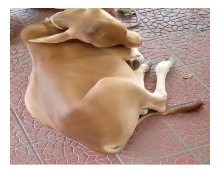
Figure (1.1): Initial observation (Lameness)