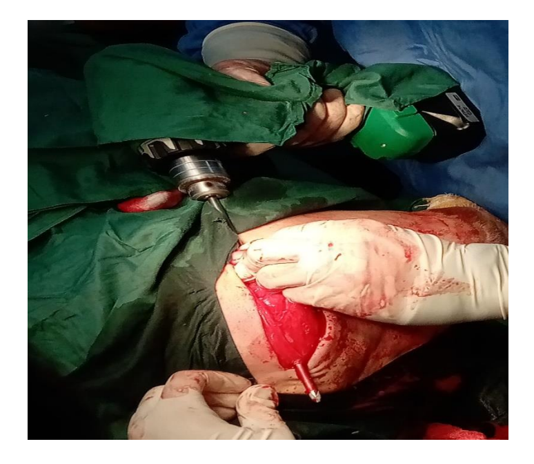
Figure (1.6): Drilling intramedullary pin