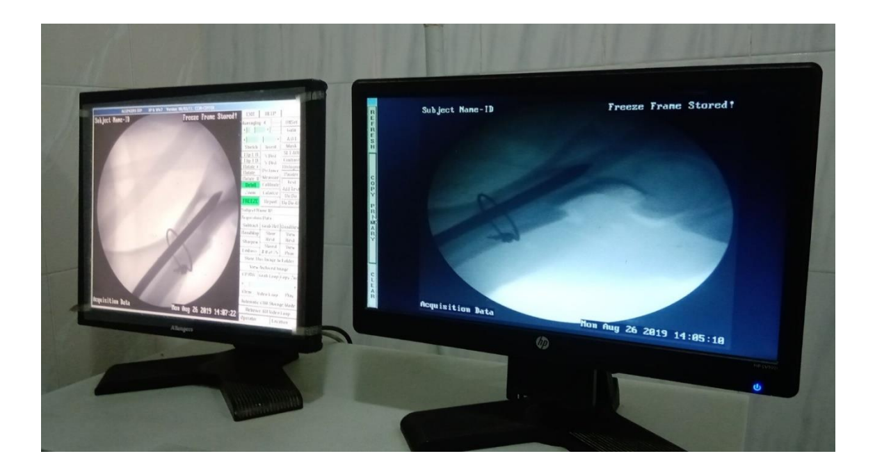
Figure (2.0): Radiograph (After surgery)