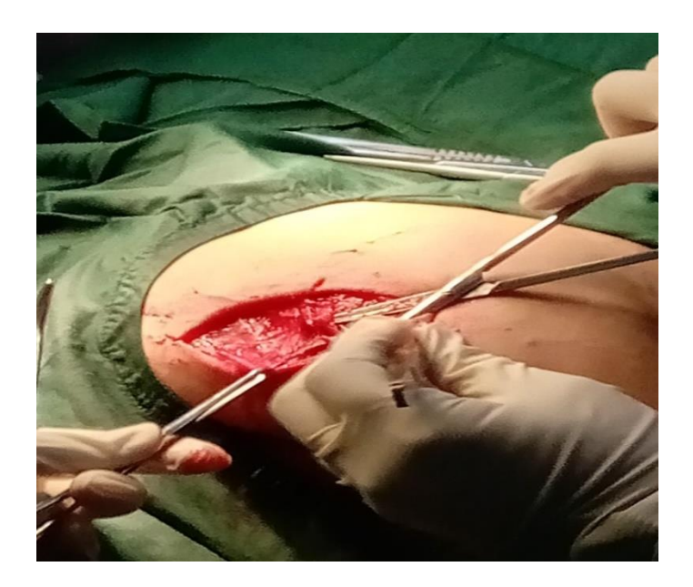
Figure (1.4): Make incision and muscle separation