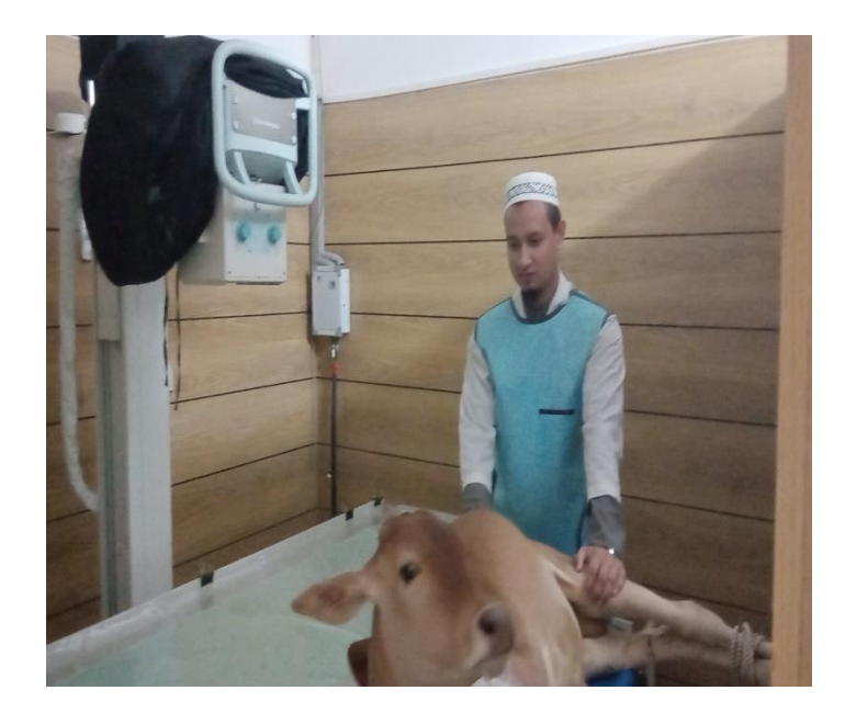
Figure (1.2): Radiological examination (Before surgery)