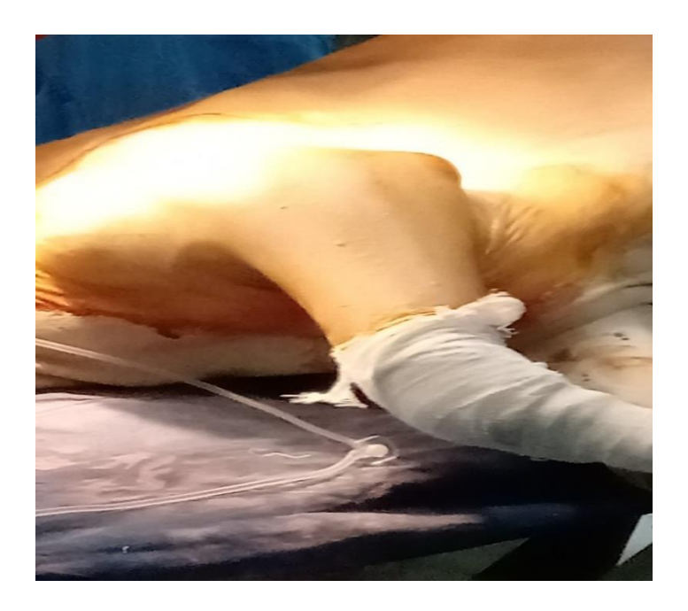
Figure (1.3): Preparing for surgery