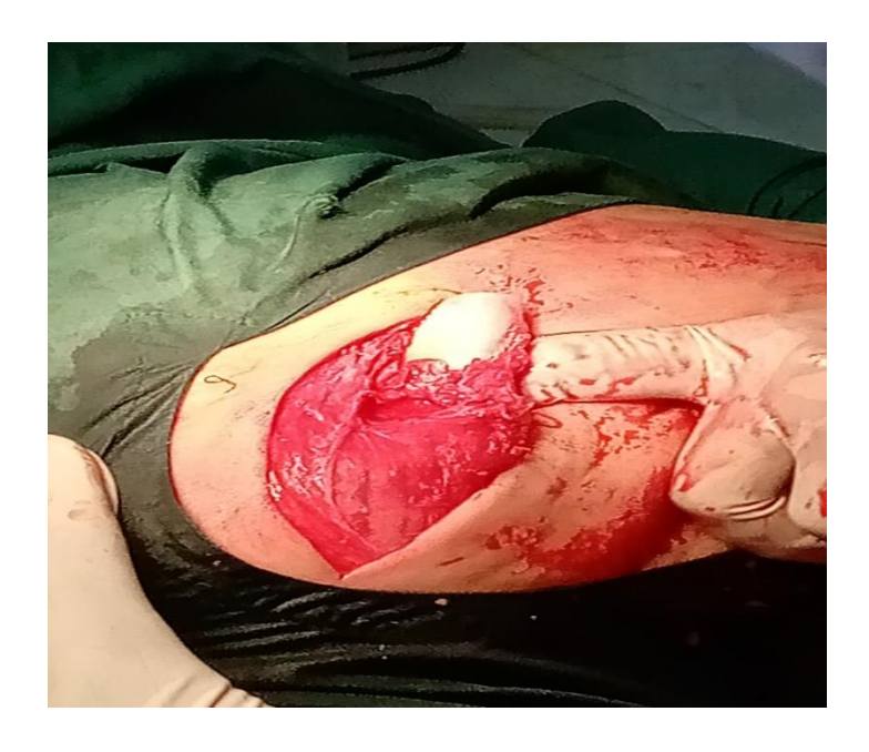
Figure (1.5): Exposing of the bone