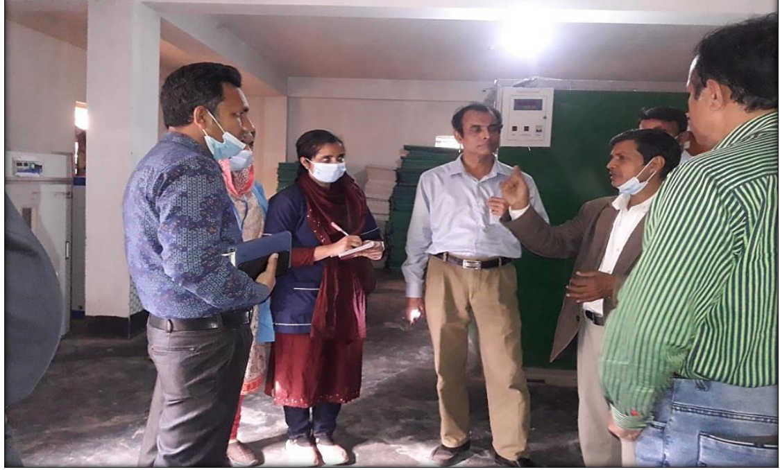
Figure 1: Collecting data through questioning from the farm owner