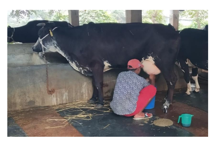
Fig 8: Unhygienic milking area.

A perusal of table 1 showed that 80% of the respondents keep milking area clean, disinfected, from insects & flies. None of the respondent clean animals shed before 15 minutes of milking that maybe the scarcity of time & poor acquaintances about the importance of keeping milking area clean for quality milk production. This visualization get support from the Mohan Kumaret al., 2016.