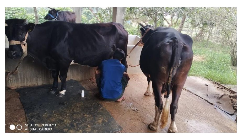
Fig 10: Milking by clean dressed healthy personnel.