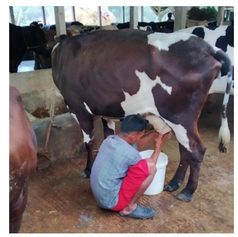
Fig 12: Full hand milking technique.