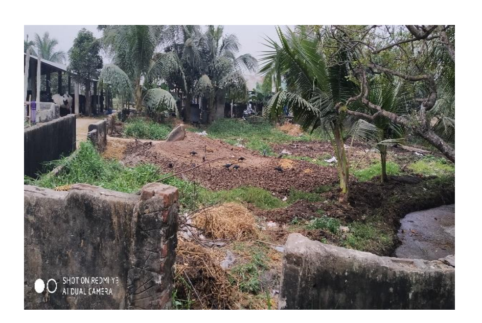
Fig 6: Collection pit.