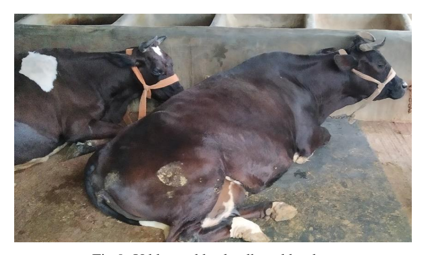
Fig 9: Udder and back adhered by dung.

It's revealed in the table 1 that, 80% of the respondents adopted removal of dung & mud by washing the udder & 50% of respondents are adopted wipe udder with dry clothes after udder washing & different clothes are used for diseased udder respectively. A very few 20% of the farmers performed regular examination of teats, udder & milk by veterinarian. None of the farmers practice pre & after teat dipping in potassium per manganite. The findings are relevant with the findings of Gade et al., 2012&Surkaret al., 2014. This malpractice is due to lack of proper guidance & awareness of the farmers about teat dipping which is important for udder health management and avert infection.