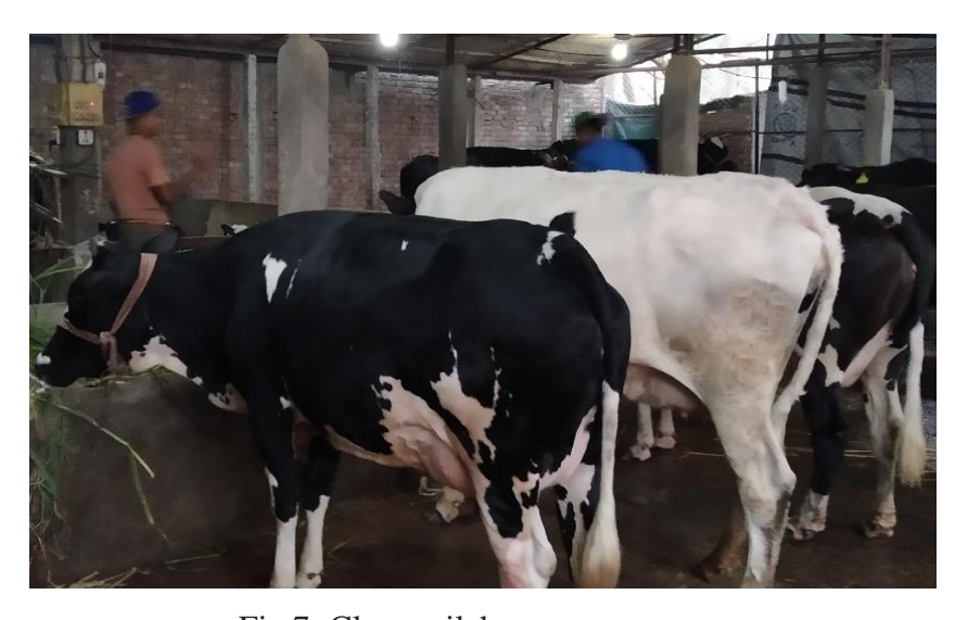
Fig 7: Clean milch cow.

A close look at the table 1 revealed that 100% of the respondents vaccinate & deworm the animals regularly as well as clean & wash animals every day. The reasons behind high adoption of vaccination & deworming of animals were probably due to the well activities of DLS & District livestock office but it is a matter of regret that 30% of the respondents clipping hair around the udder & hind quarts of animals and only 20% of the farmers adopt regularly examine the animals by veterinarian which is a portent of low preventive measures for clean milk production.