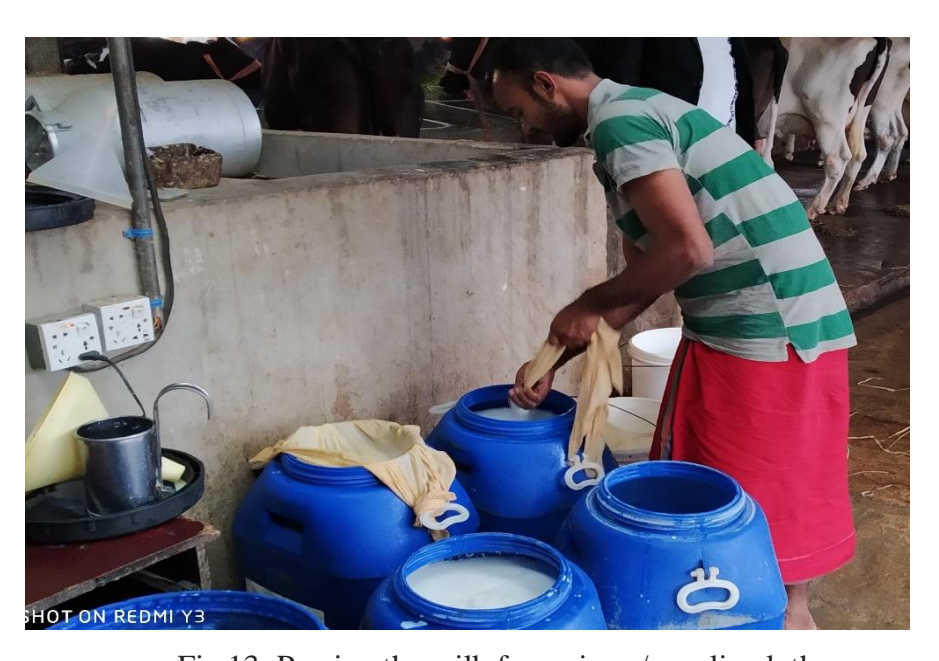
Fig 13: Passing the milk from sieve / muslin cloth.

If the teat canal of milch animals remain open for few minutes & not to close after milking it may causes serious diseases like mastitis to the milking Animal which may causes devastating loss to the farmers. For choking this, animal must be feed after milking so that it may remain in standing position. A perusal of table 1 revealed that only 50% of the farmers adopted post milking feeding of the animals for 15 minutes so that the animals may remain in standing position & not to lay. About 70% of the respondents had adopted the practice of passing the milk from sieve/ muslin cloth for the removal of dirt or undesirable things. As the scarcity of cold storage facilities majority (80%) of the farmers transfer milk to the processing unit immediately or to middle man dealers after milking.