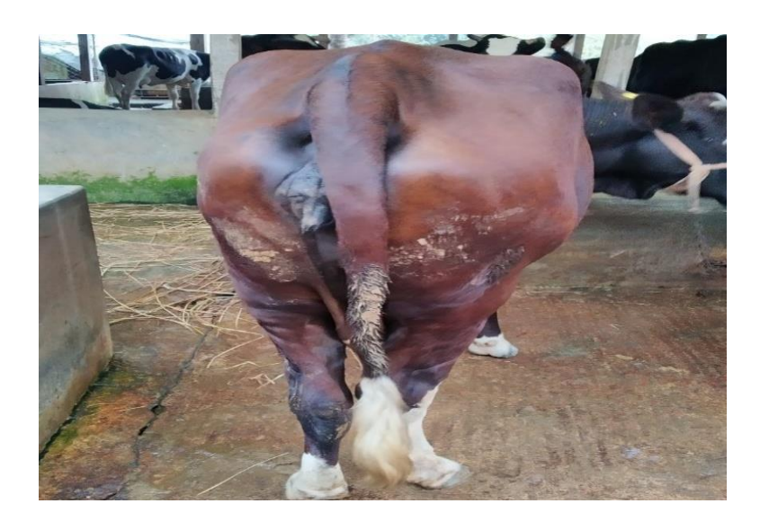
Fig 11: Dirty hind quarter / back of the cow.

Cleaning of animals is the foremost step of hygienic maintenance of clean milk production followed by cleaning of milers & utensils. A close perusal of the table 1 revealed that maximum respondents (90%) practiced washing the whole animals. Most of the milkers (80%) practiced cleaning teat & udder before milking but none of them were practiced washing hind quarters/ back of the cows before milking. Due to tight schedule of farming they paid less attention in this regard. Similar observation also found in the study of Girish et al., 2014 which revealed that very few milkers washing hind quarters before milking.