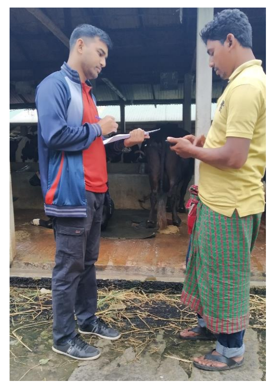
Fig 2: Study Area.