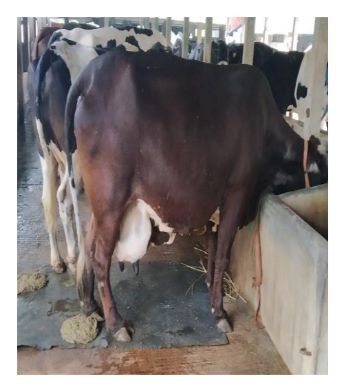
Fig 4: Animal house without well ventilation Fig 5: Animal house without well System.