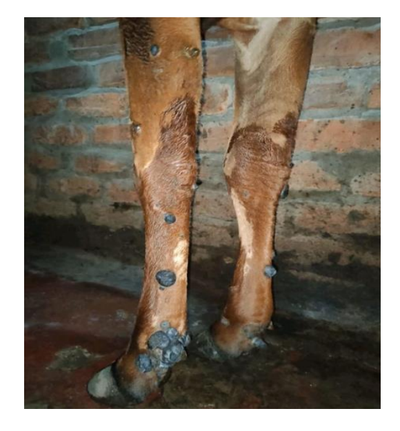
Fig 2.1.2 Affected hind limb for the heifer with papillomatosis.