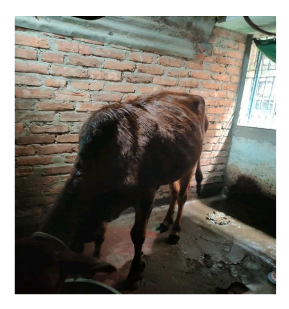
Fig 2.1.1 Housing condition of the heifer

A 2-years-old heifer suffering from severe generalized papillomatosis was presented in S. A. Qaderi Teaching Veterinary Hospital (SAQTVH), CVASU, Chattogram, Bangladesh with a history of two months of infection. The animal has a history of not receiving vaccinations or deworming treatments. The house has wet floors and receives insufficient sunlight, making the rooms appear gloomy. The feed habit consists of bran, husk, hay, and banana residue, administered twice daily. No treatment was given until 2 months after the initial infection. The animal was apparently healthy. The case was diagnosed as papillomatosis based on the clinical signs.