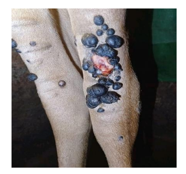
Fig 2.6.1 Secondary bacterial infection despite initial treatment with Liq. Thuja 200

After being brought to the hospital, initially autohemotherapy, ivermectin, antihistaminic drugs, and an autogenous vaccine were administered. No improvement was observed. Rather, the growth of some new warts was seen.