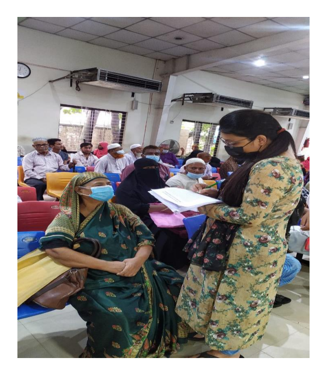
Figure 3: Data collection from the patients