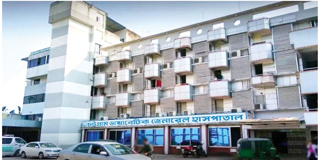
Figure 2: Chattogram Diabetic General Hospital (CDGH)