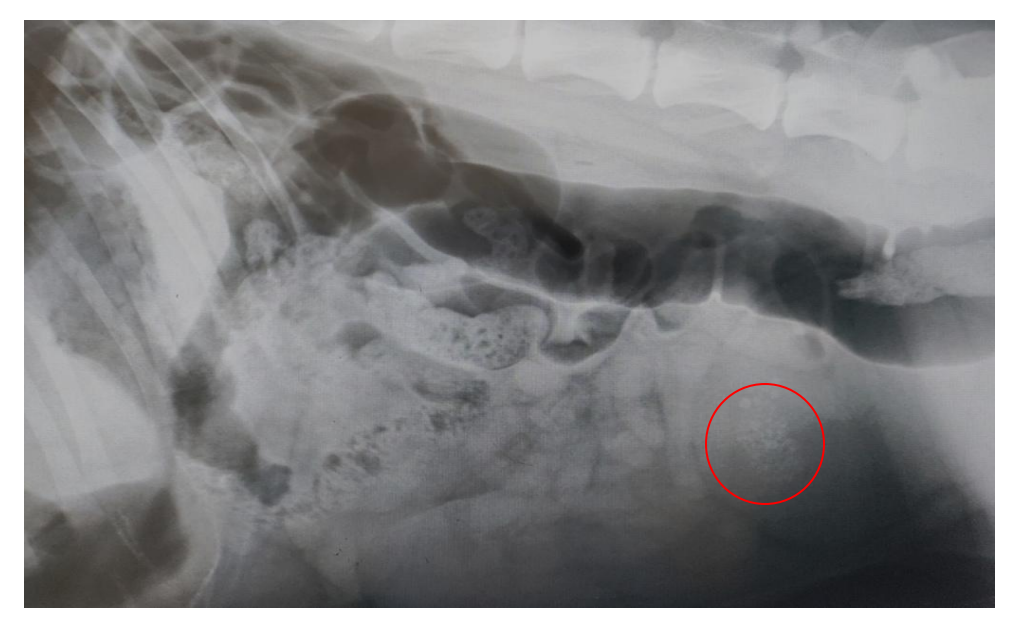
Figure 3.1. The left lateral view of abdominal radiograph showing multiple radio opaque shadow in urinary bladder