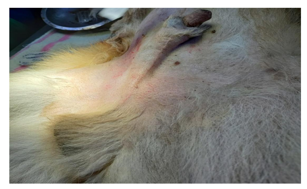
Figure 1.3. Clipped and shaped intended surgical site