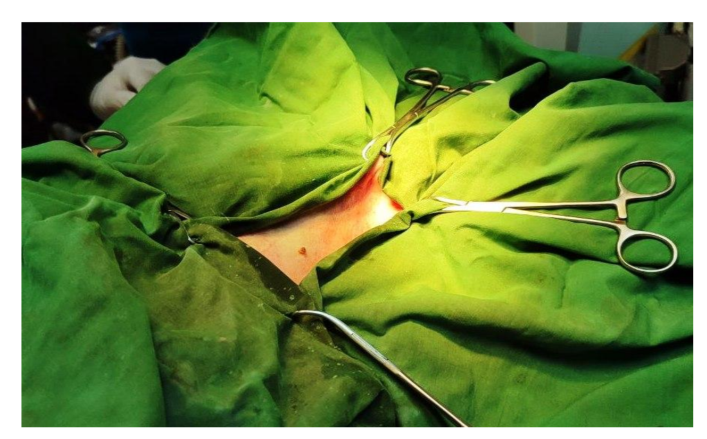
Figure 1.4. Placing draper over the area of the surgery