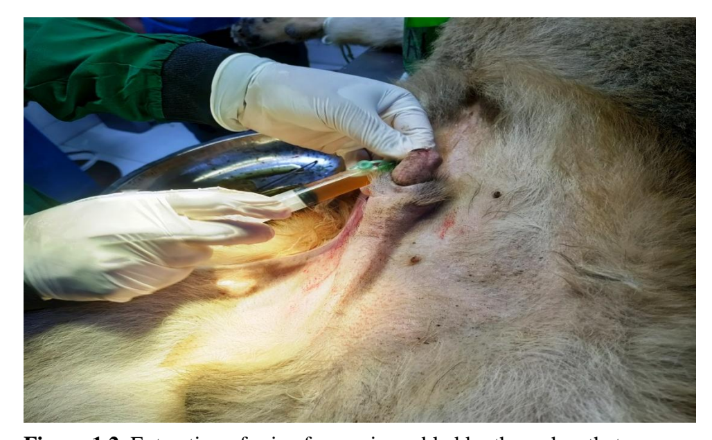
Figure 1.2. Extraction of urine from urinary bladder through catheter