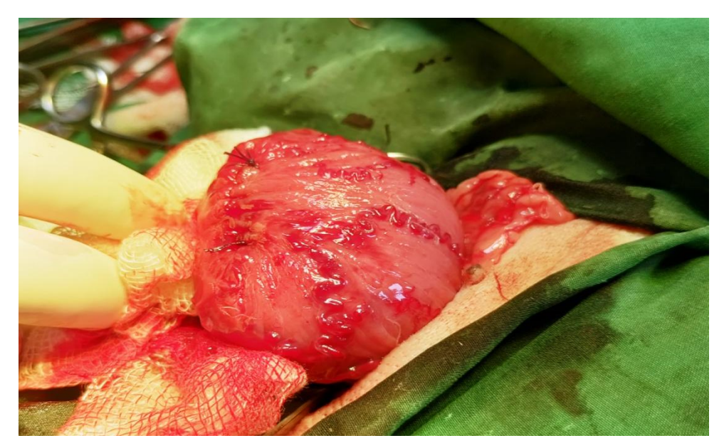
Figure 1.7. The urinary bladder incision closed in a cushing suture pattern