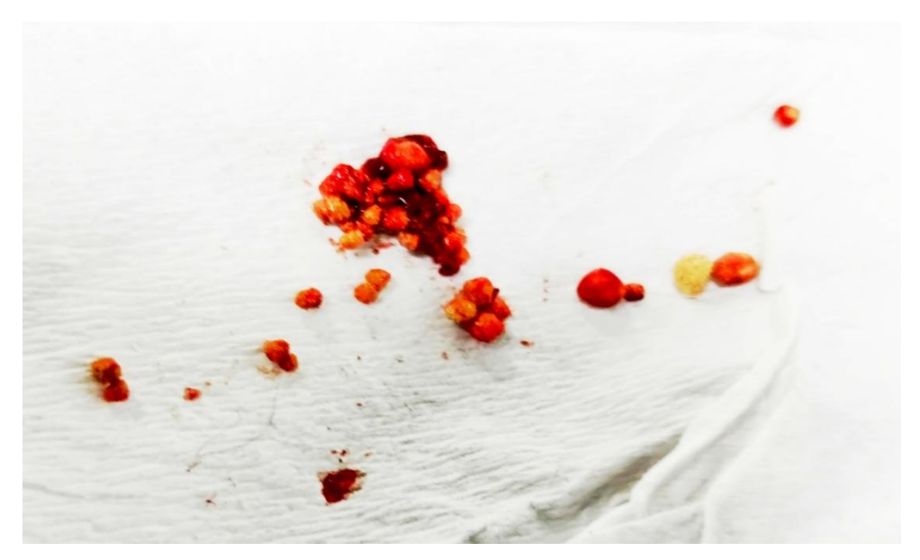
Figure 1.10. The bladder stones