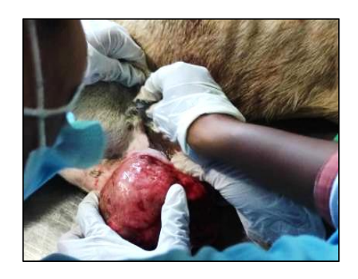
Fig. 4: Shaving of Surgical site

and then applied a soft cotton bandage on the site (Fig. 13). The excised tumor mass was incised for gross examination (Fig. 14).