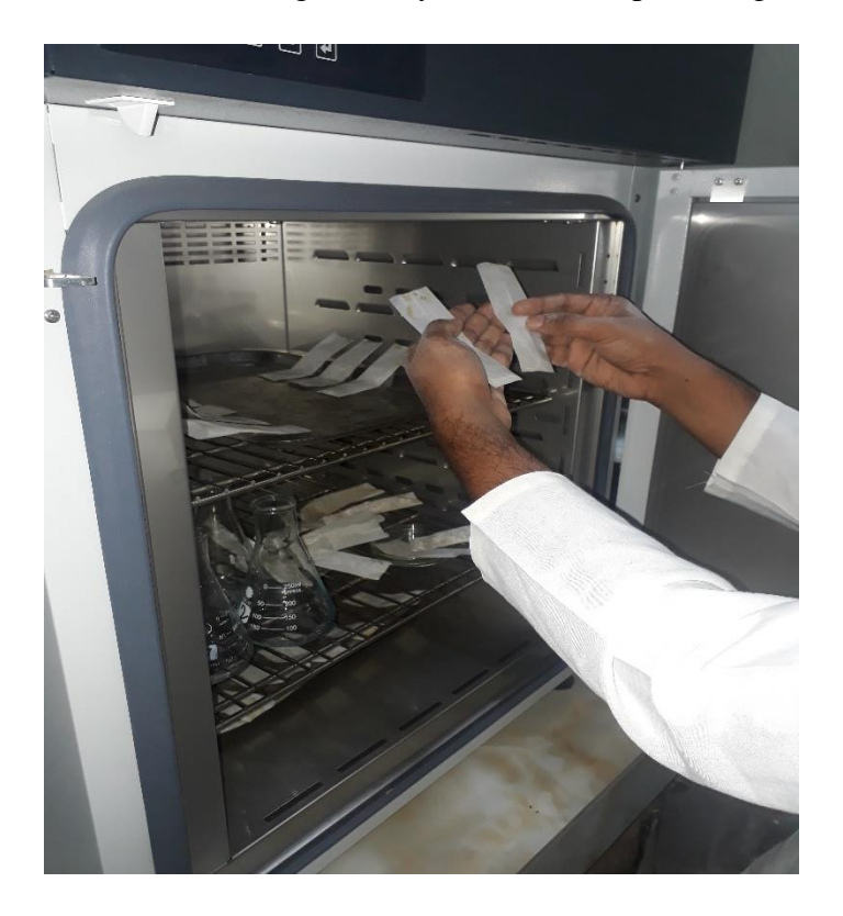
Figure 2.4: Drying of undigested feed with incubator.

Digestibility measurement: Firstly, TMR and FTMR feed sample weight was taken before digestion. After digestion of each incubation period weight of undigested dried feed of each serum bottles was taken. Difference of feed weight before digestion and digested feed measured. Then Digestibility calculated as percentage.