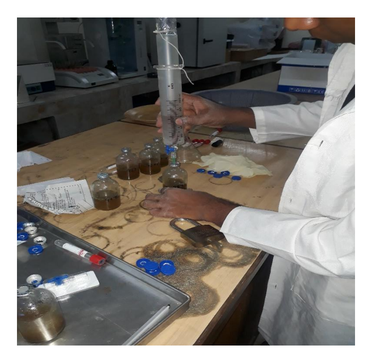
Fig.2.2: Collection of Total gas from serum bottles

2.14: pH Measurement: The pH meter used to determine the pH value was Hanna HI 2211 bench pH meter.