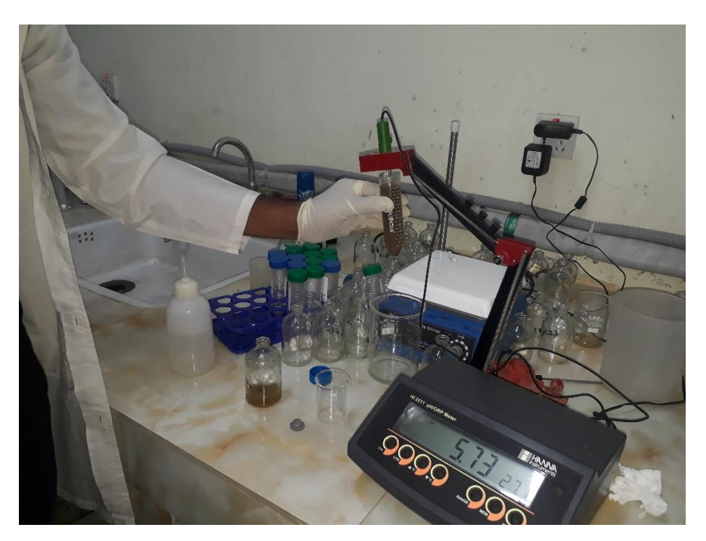
Figure.2.3: After digestion pH measuring with pH meter

2.14: pH Measurement: The pH meter used to determine the pH value was Hanna HI 2211 bench pH meter.