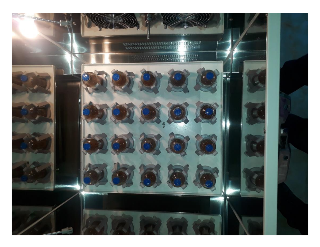
Fig.2.1: Serum bottles with feed sample and buffered Rumen fluid in shaking incubator

Hattori and Matsui (2008). For each incubation time, five replicates per experimental treatment were used.