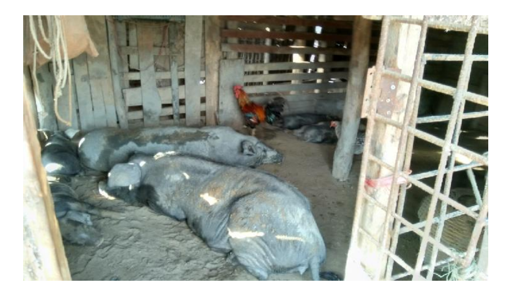
Figure 4: Housing