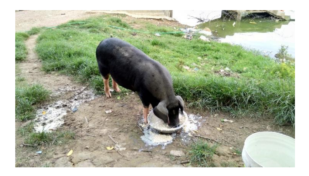
Figure 1: Concentrate feeding of Pig