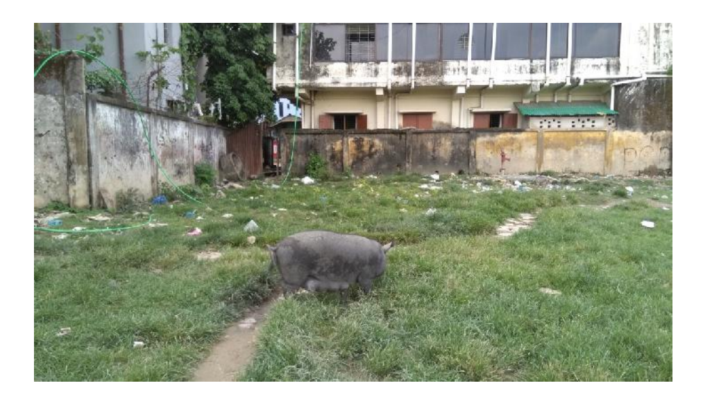
Figure 3: Scavenging