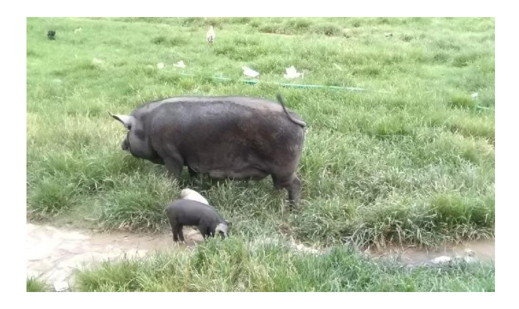
Figure 2: Piglets with sow