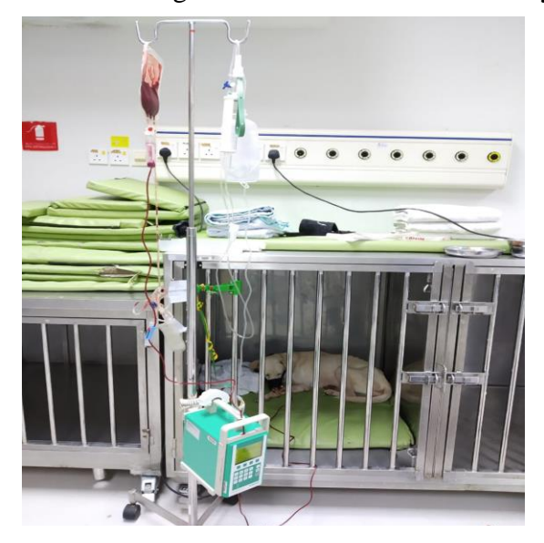
Figure 02: Whole blood transfusion to Canine Monocytic Ehrlichiosis affected dog.