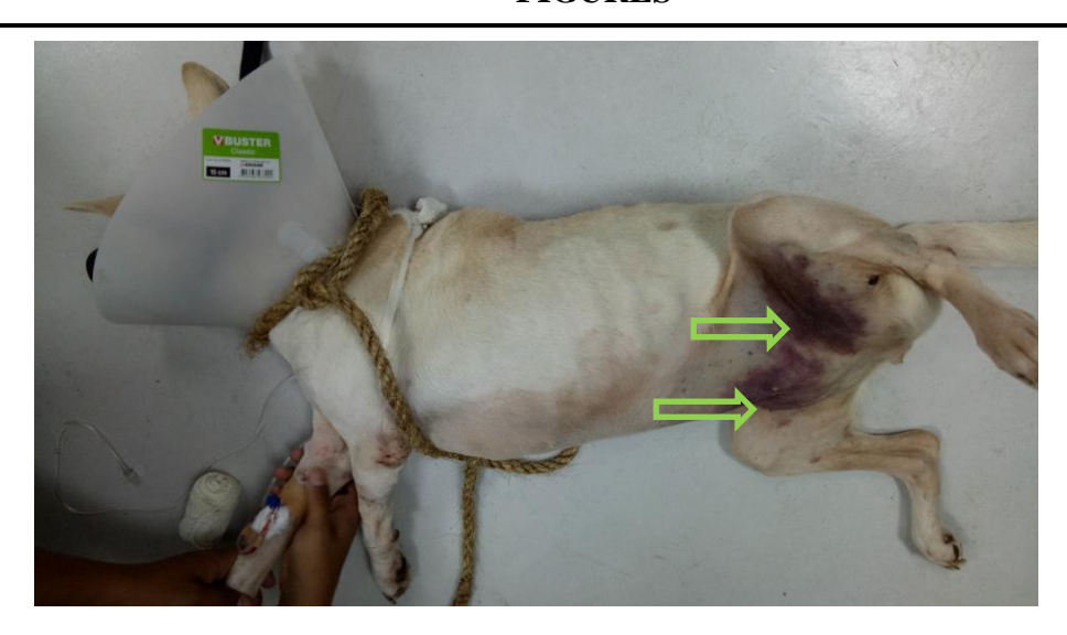
Figure 01: The infected dog with of several cutaneous echymoses (arrow).