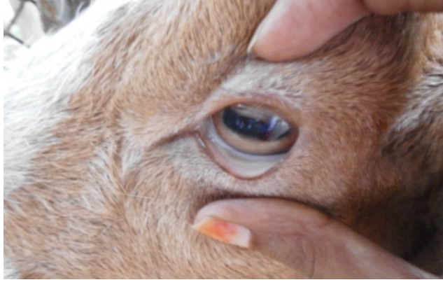
Fig 2 : Dull and Depressed goat