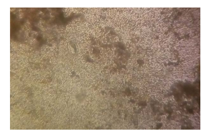
Fig- 5: Embryonated egg of S. papillosus