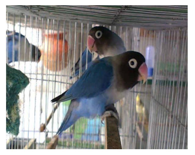
Fig-3: Java Finch