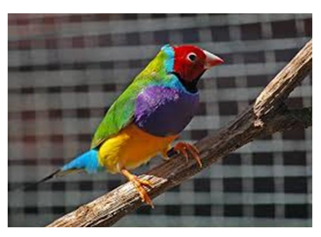
Fig-4: Gouldian Finch