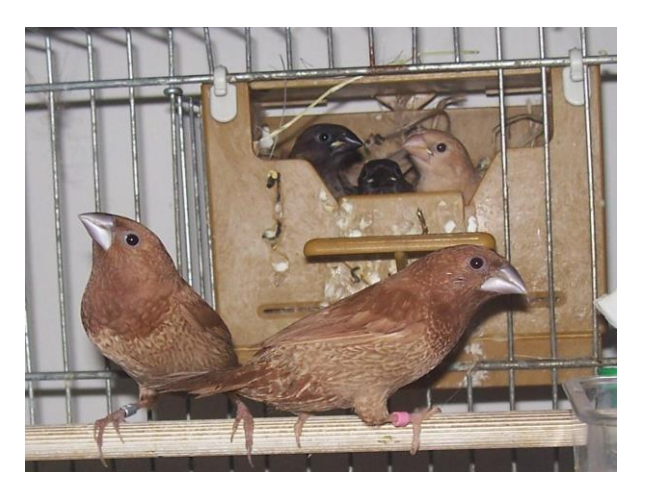
Fig-5: Bengalese Finch