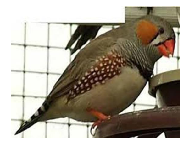
Fig-2: Zebra Finch