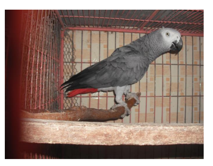
Fig-8: African grey

scientists assumes that it has the intelligence of a six years old boy and generally they outlive their owner due to having a long life spans of age