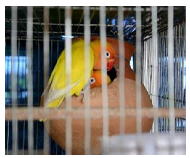
Fig-6: Love bird