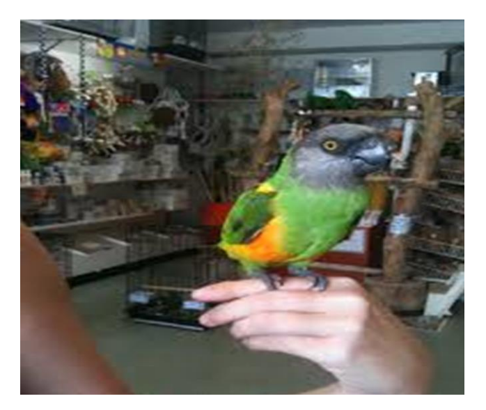
Fig-10: Senegal parrot